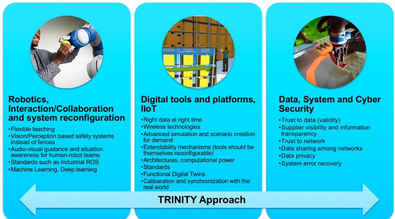
Figure 1 TRINITY approach.

In order to apply to the TRINITY Open Call 1, it is mandatory to register at www.trinityrobotics.eu/registration