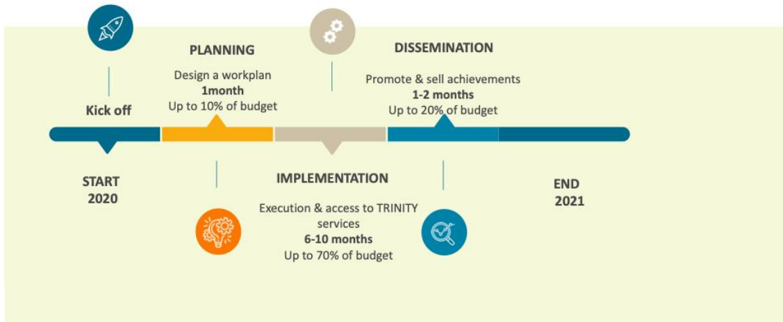
Figure 4 Project workflow.