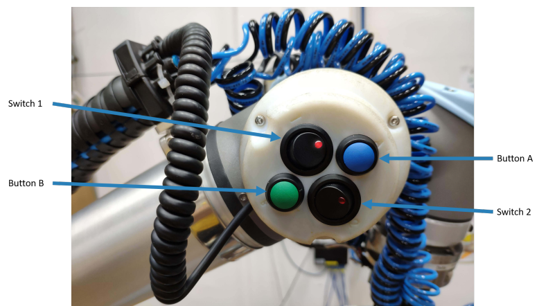
Figure 1: The button interface

To accelerate the process of robot skill acquisition, we provide a custom-made plastic cover with buttons for one of the robot's joints (see Figure 1). The cover houses two buttons and two switchers. The latter have an LED showing their status (in the picture below the switch with the label 1 is turned on). These buttons and switches are programmable and their functions differ depending on the skill acquisition process.